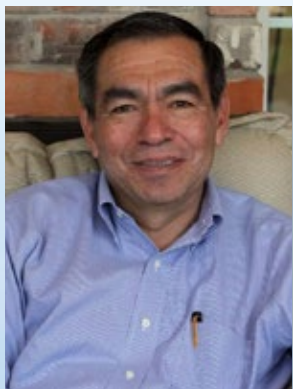
LTG (Ret.) Ricardo Sanchez

We know that philanthropy provides a margin of excellence that enables our university to recruit and retain the best faculty, staff and students, and we remain grateful to each of you for your continued support and generosity.