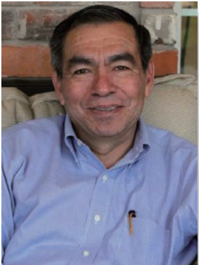
LTG (Ret.) Ricardo Sanchez

At the beginning of 2020, the Texas A&M University-Kingsville Foundation had just surpassed one of the largest milestones in its almost 50-year history. With You. Without Limits. The Campaign for Texas A&M University-Kingsville – the university’s first comprehensive capital campaign – eclipsed a tremendous goal of $100 million raised in private support.